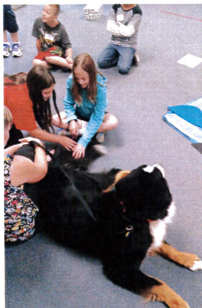
Children play with a dog named Guinness at the Benzie County Reading Camp in July 2015 sponsored by St. Philip's, Beulah

A video of the 2015 Reading Camp in Albion can be seen at edwm.org/reading_camp.html .